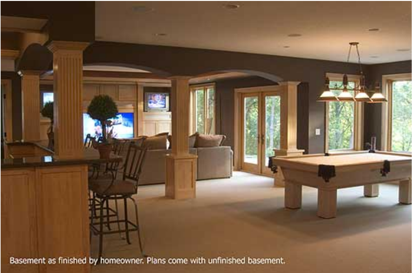
Basement as finished by homeowner. Plans come with unfinished basement.