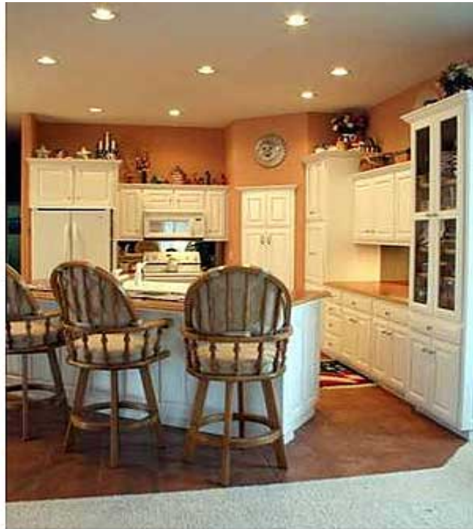
Interior modified by builder