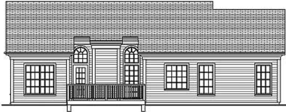
REAR ELEVATION 30422.FRM