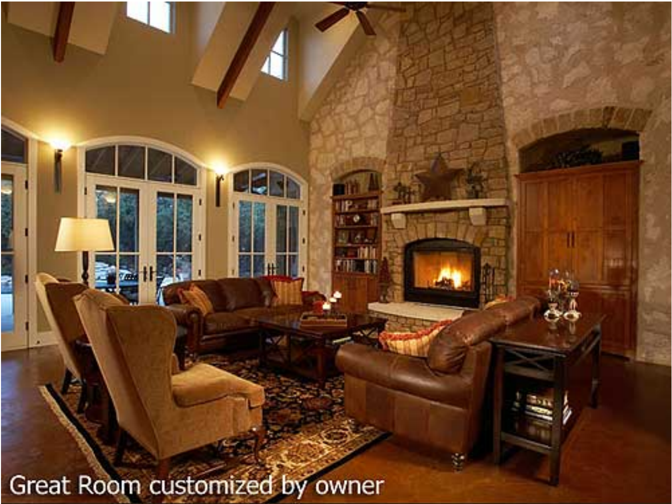
Great Room customized by owner