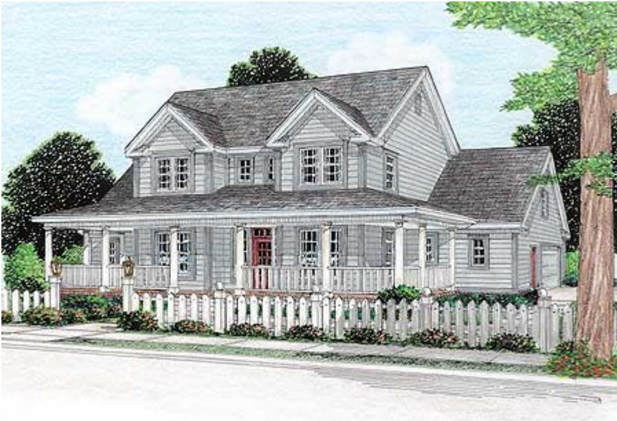
Plan W40753DB: Farmhouse Design Has Three Porches

House plans are Copyright © 2009 by our architects and designers.