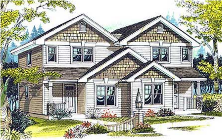
Plan W2879J: Cozy Craftsman Duplex

House plans are Copyright © 2009 by our architects and designers.