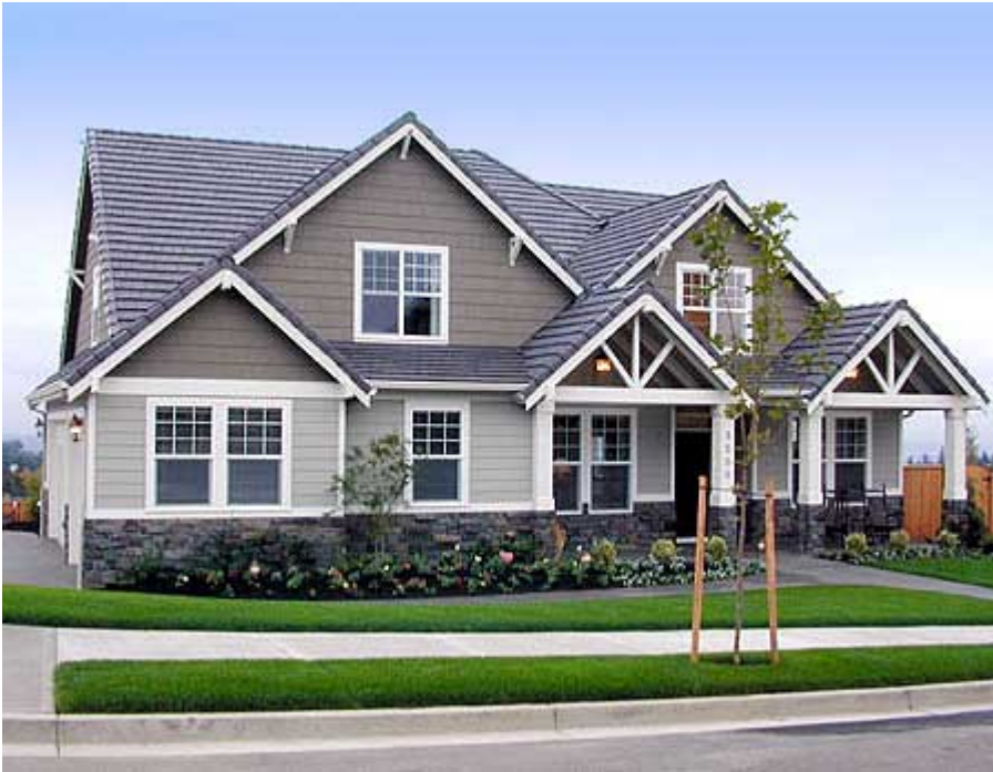
Plan W6912AM: Twin Porches

House plans are Copyright © 2009 by our architects and designers.