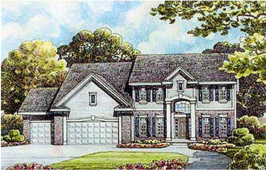
Plan W5032CZ: Splendid Entry

House plans are Copyright © 2009 by our architects and designers.