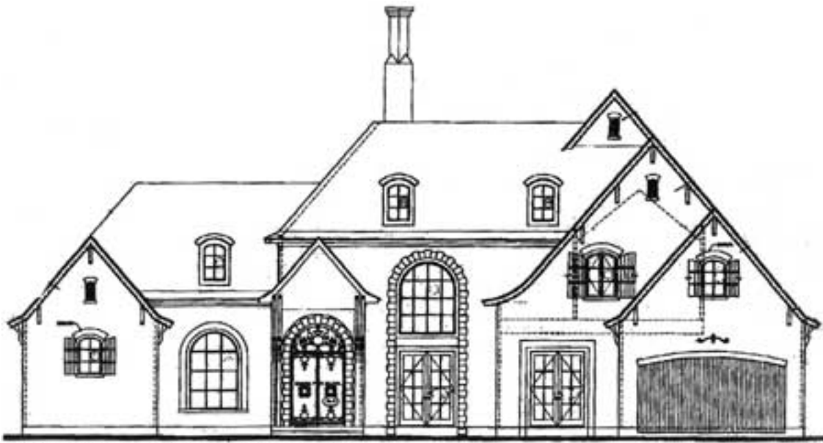
View of front from inside courtyard