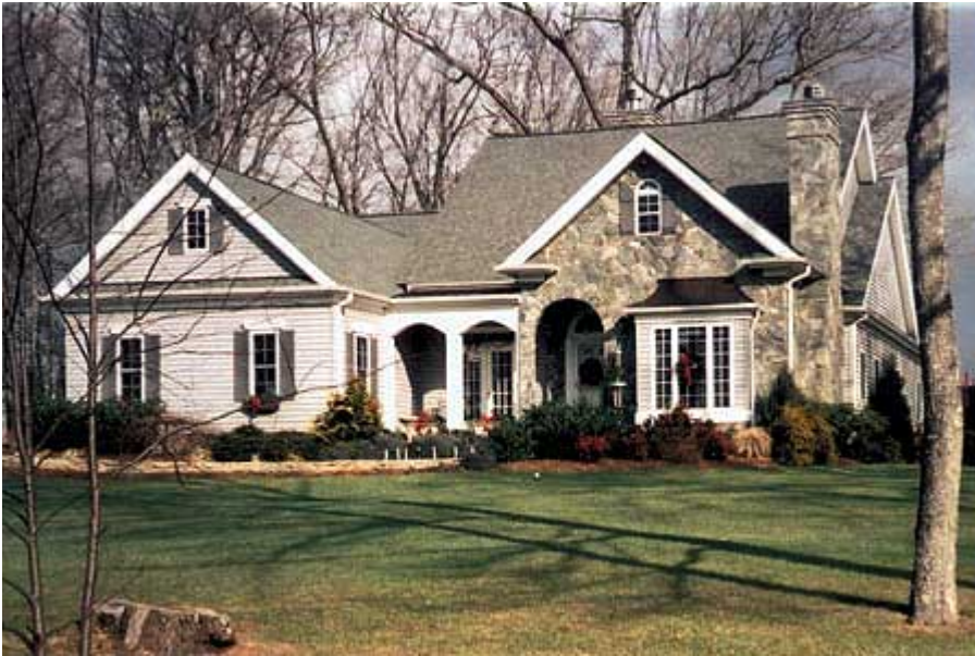
Plan W5601AD: Picturesque Cottage

House plans are Copyright © 2009 by our architects and designers.