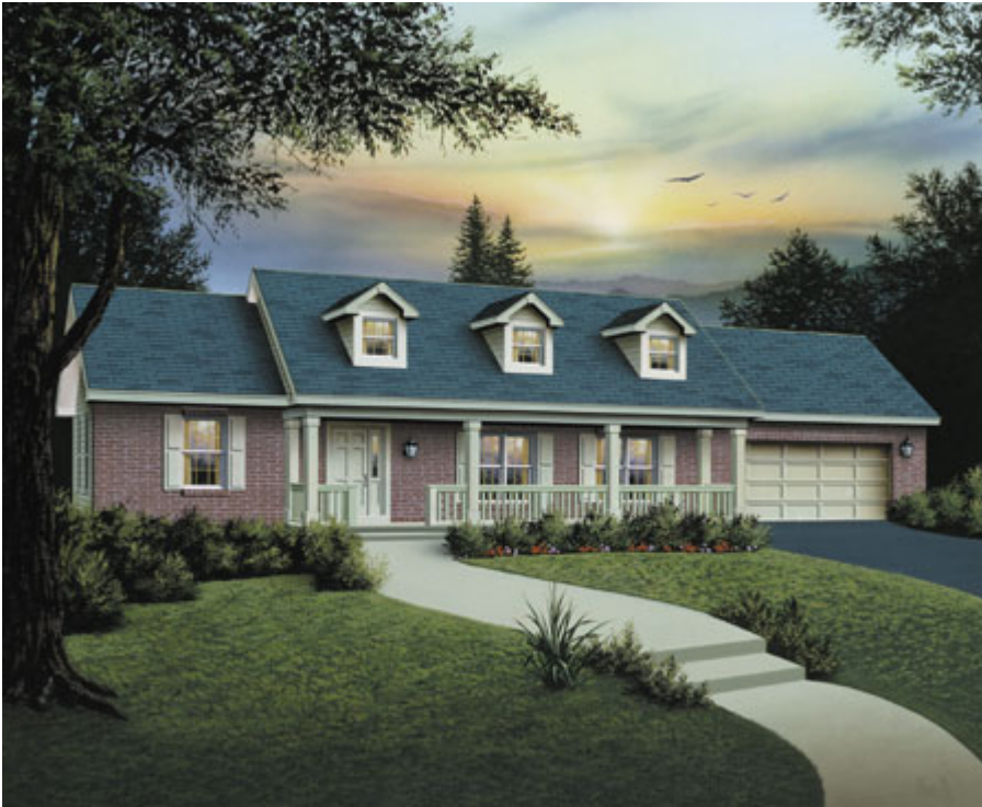
Plan W5723HA: Classic Ranch With Expansive Porch

House plans are Copyright © 2009 by our architects and designers.