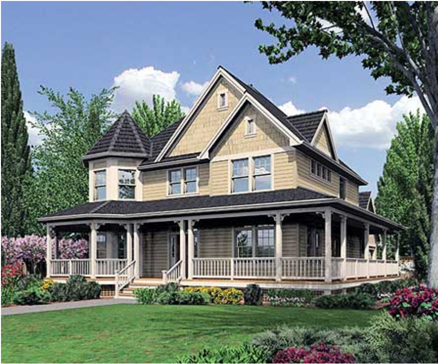
Plan W6908AM: Fabulous Wrap-Around Porch

House plans are Copyright © 2009 by our architects and designers.