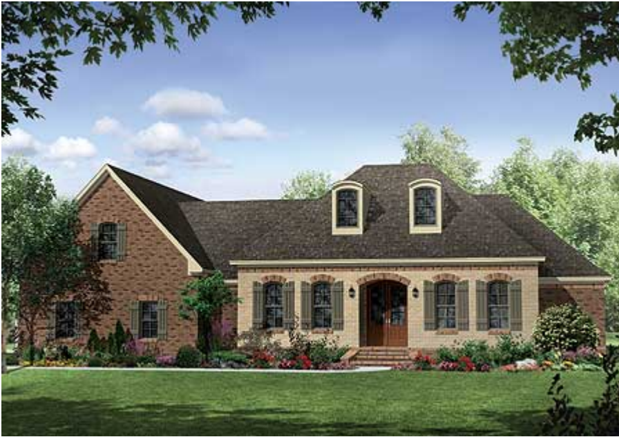
Plan W51056MM: French Country Favorite

House plans are Copyright © 2009 by our architects and designers.