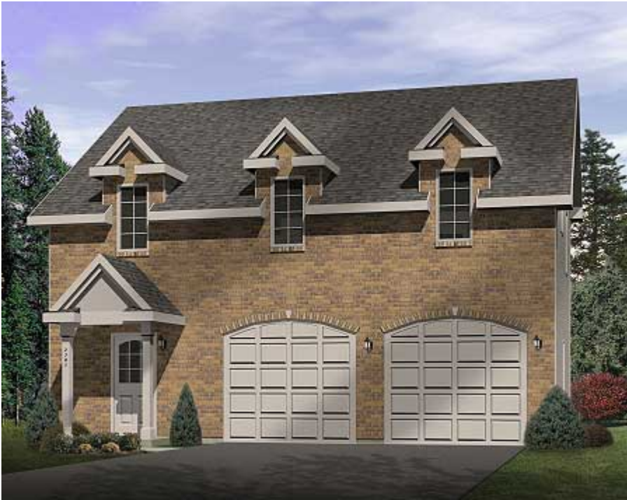
Plan W2240SL: Two Bedroom Carriage House

House plans are Copyright © 2009 by our architects and designers.