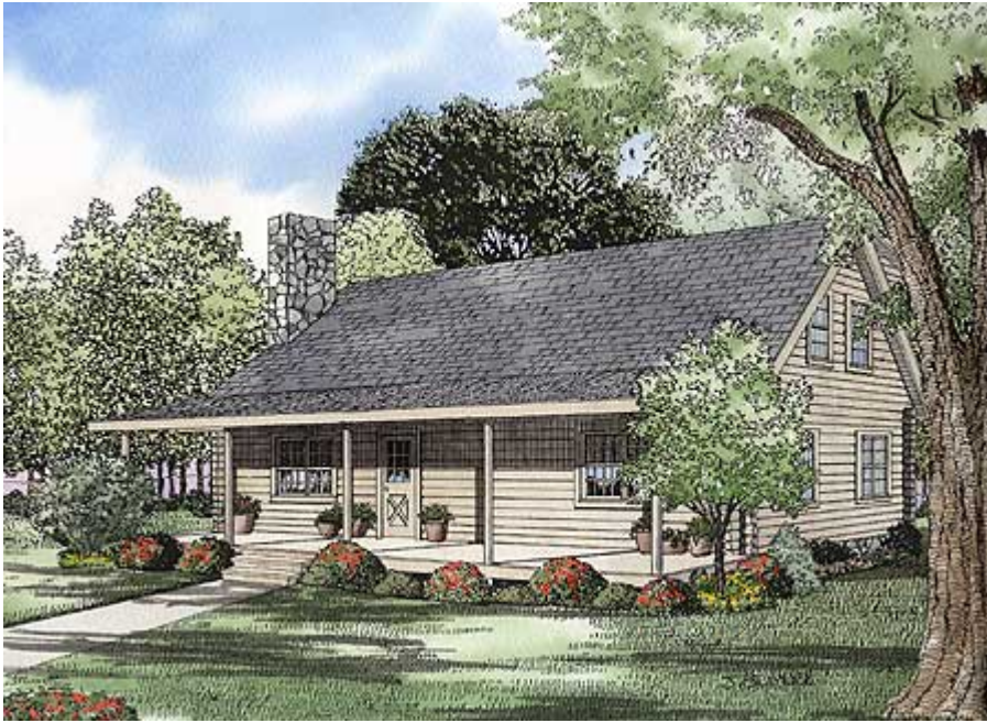
Plan W59023ND: Log Simplicity

House plans are Copyright © 2009 by our architects and designers.