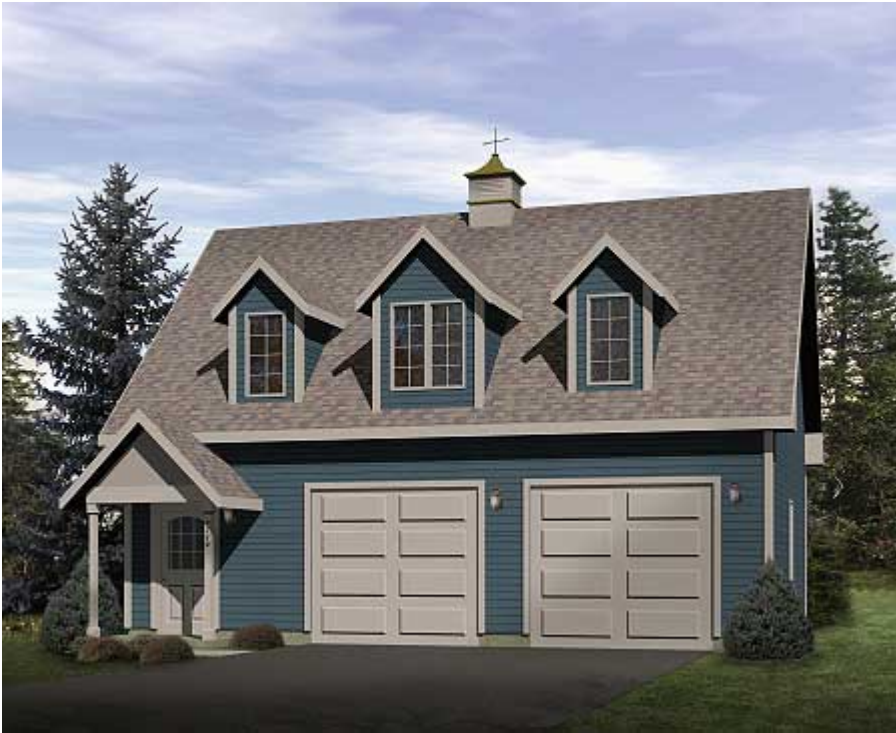
Plan W2227SL: Side-Entry Carriage House

House plans are Copyright © 2009 by our architects and designers.