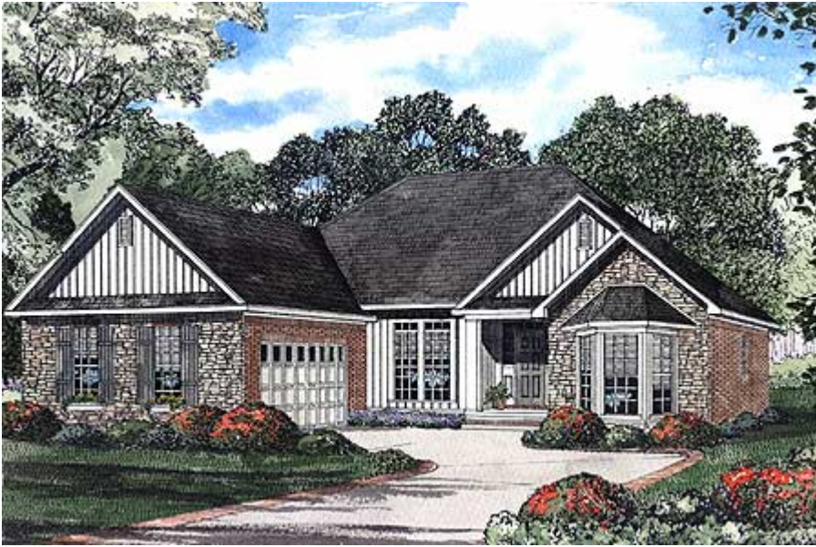
Plan W59218ND: Courtyard Entry Garage

House plans are Copyright © 2009 by our architects and designers.